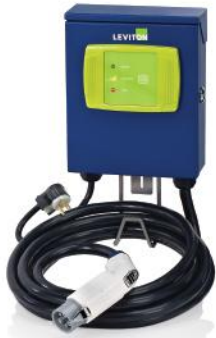
Level 2 32 Amp