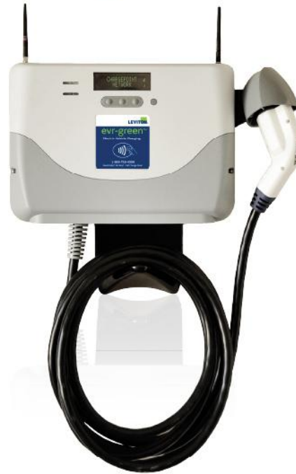
Level 2 evr-green 500